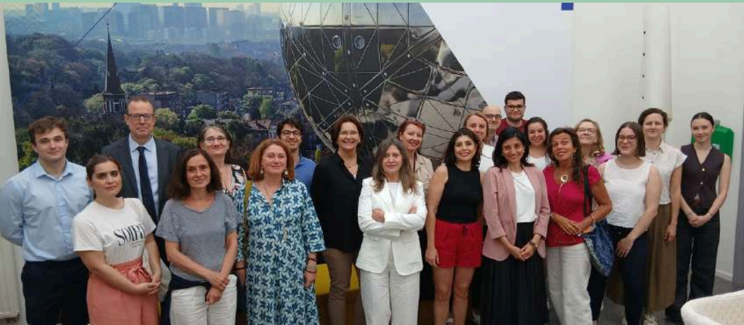
Brussels Delegations meeting, NECSTouR offices