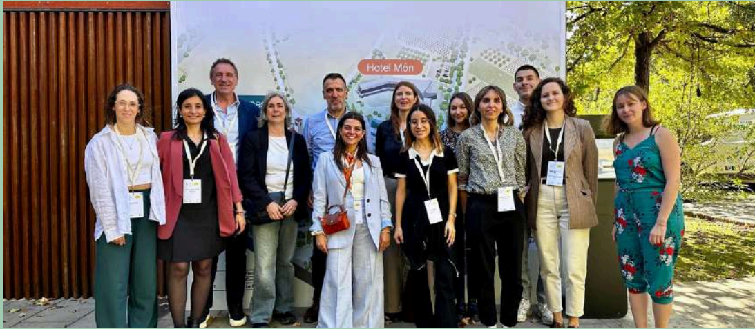
Global Ecotourism Forum