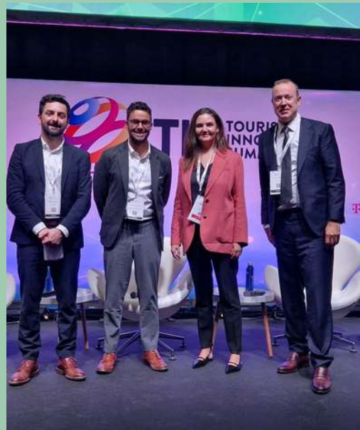
Tourism Innovation Summit