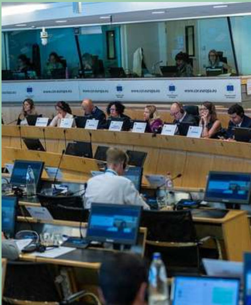
NAT Commission, European Committee of the Regions