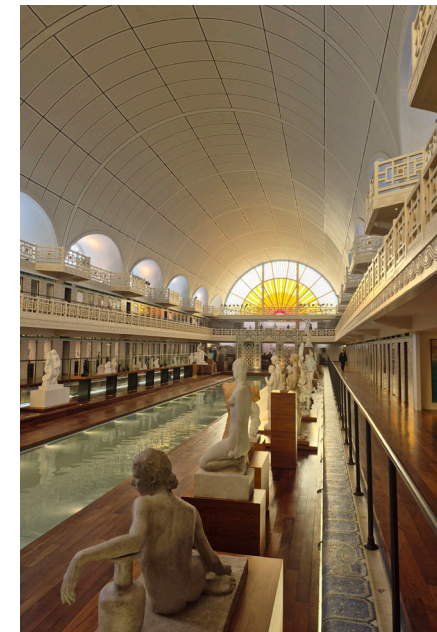
Musée La Piscine - Roubaix, France.

The territorial diversity of the partners involved allows to test slow tourism models in varied socioeconomic and cultural settings, enabling partners to co-develop transferable solutions and build a resilient community of practice across North-West Europe.