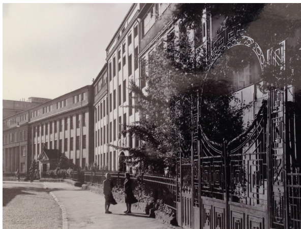
Hans Sachs Building - Rheinberger's shoe factory - Pirmasens, Deutschland.

Despite efforts to repurpose heritage sites, many towns still struggle with revitalization, particularly in disadvantaged or emerging neighbourhoods. Industrial heritage assets like old factory buildings, canals and sites, often remain underused as “hidden gems,” with untapped potential to support sustainable urban tourism.